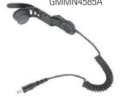
Savox HC-1 GMMN4585A

Complete the solution with the Savox C-C400 com-control unit that enables the use of your two-way radio in hazardous conditions. Designed to be especially robust for the most extreme environments, the extra-large push-to-talk button ensures transmission even when used underneath gear and protective clothing.