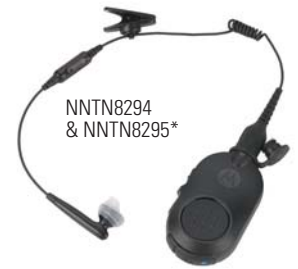
NNTN8294 & NNTN8295*

Bluetooth 2.1 audio is embedded in the radio enabling fast and secure pairing with a variety of Bluetooth accessories. Easy to attach and pair, Motorola Solutions Bluetooth accessories enhance performance and security wherever you work. Officers can talk discreetly undercover, move without wires and use their radio like never before.