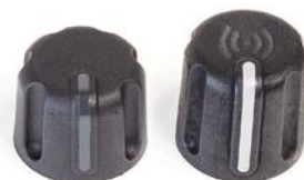
Standard Control Knob RFID Control Knob

◀ Optional colour identification bands for groups with different tasks, coverage areas or shifts