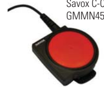
Savox C-C400 GMMN4579A

Complete the solution with the Savox C-C400 com-control unit that enables the use of your two-way radio in hazardous conditions. Designed to be especially robust for the most extreme environments, the extra-large push-to-talk button ensures transmission even when used underneath gear and protective clothing.